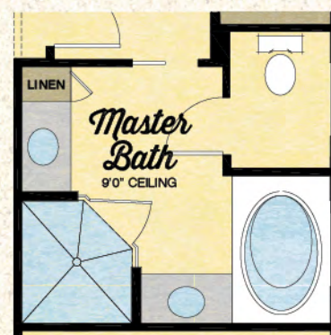
Available Master Bath Variation